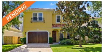
3913 S Kenwood Avenue | 4 Bed | 4 Bath | 3,423 SF Last offered at $919,999