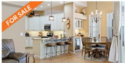
4802 Queen Palm Terrace NE | 4 Bed | 3 Bath | 2,484 SF Offered at $739,900