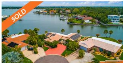
4300 44th Street S | 4 Bed | 2/1 Bath | 2,588 SF Last offered at $875,000