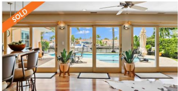
4401 43rd Street S | 4 Bed | 2/1 Bath | 2,300 SF Last offered at $885,000