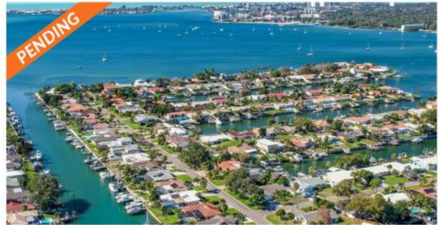
4425 45th Street S | 4 Bed | 2/1 Bath | 2,224 SF Last offered at $1,050,000