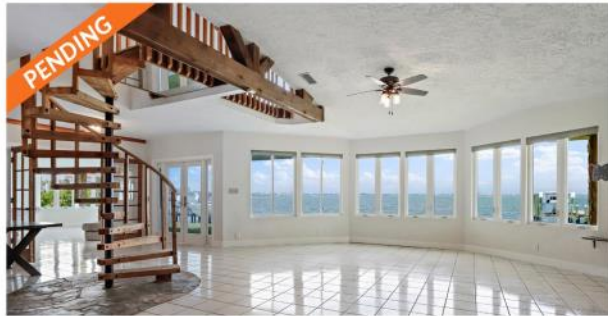
4535 45th Street S | 4 Bed | 3/1 Bath | 4,151 SF Last offered at $1,189,000

Recognized as one of the "10 BEST" in customer satisfaction three years in a row! Some of the many homes for sale or recent sold by Debbie Zito and her team. We look forward to working with you!