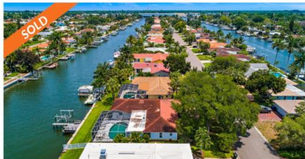
4301 48th Avenue S | 4 Bed | 3 Bath | 2,414 SF Last offered at $850,000